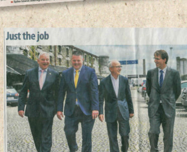
Spike Island bootcamp is a two-day intensive program for entrepreneurs looking to raise funding.

Investors, start-ups, and entrepreneurs will be held at Spike Island bootcamp. The event is a two-day intensive program for entrepreneurs looking to raise funding. The bootcamp is held at Spike Island, a former military base that has been converted into a modern business hub.